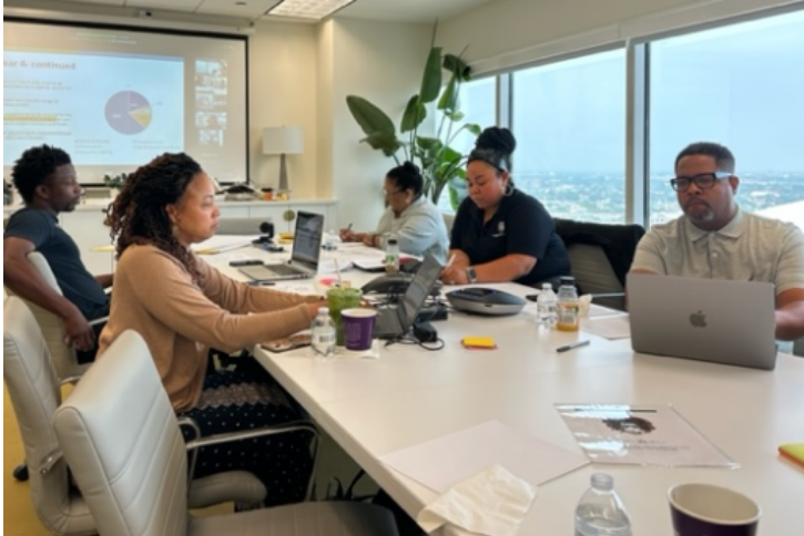
Executive Committee members working hard while discussing sustainability

convictions, economic development and growth can be sustained and further developed.